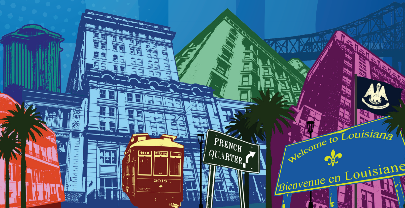
Exhibit. Sponsor. Advertise.